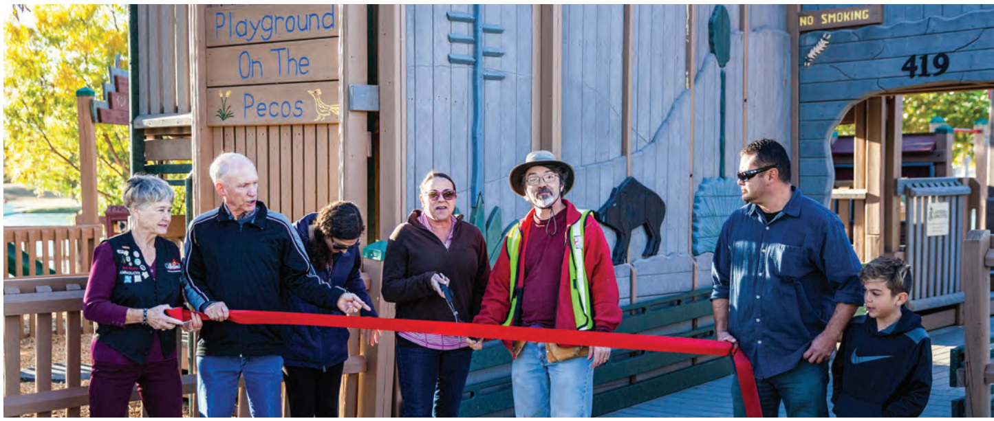
Whether volunteering to rebuild the Playground on the Pecos, providing free safety classes during SafetyFest or supporting one of the many organizations that make an impact in our community, Nuclear Waste Partnership and its employees are making a difference!